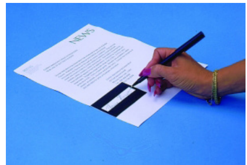
Figure 3: Signature guide